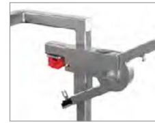
带有安全开关的安全罩 Safety guard with safety switch