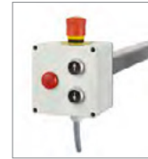
上升和下降及急停均有按钮控制 Push buttons for up/down movements and emergency stop