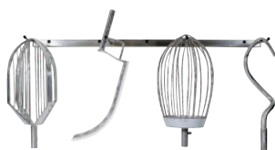
工具挂架 Tool rack