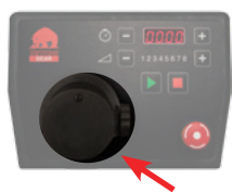
附加驱动接口 Attachment drive