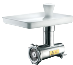
70mm 绞肉机, 包括圆盘 (带4.5mm孔) 70mm meat mincer, 4.5mm disc