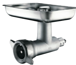
82mm 绞肉机, 包括圆盘 (带3mm孔) 和预切割器 82mm meat mincer, 3mm disc, pre-cutter