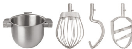
15升搅拌缸配件, 不锈钢材质 15 litre bowl, whip, hook and beater