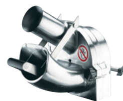
切菜机 GR20 Vegetable cutter GR20